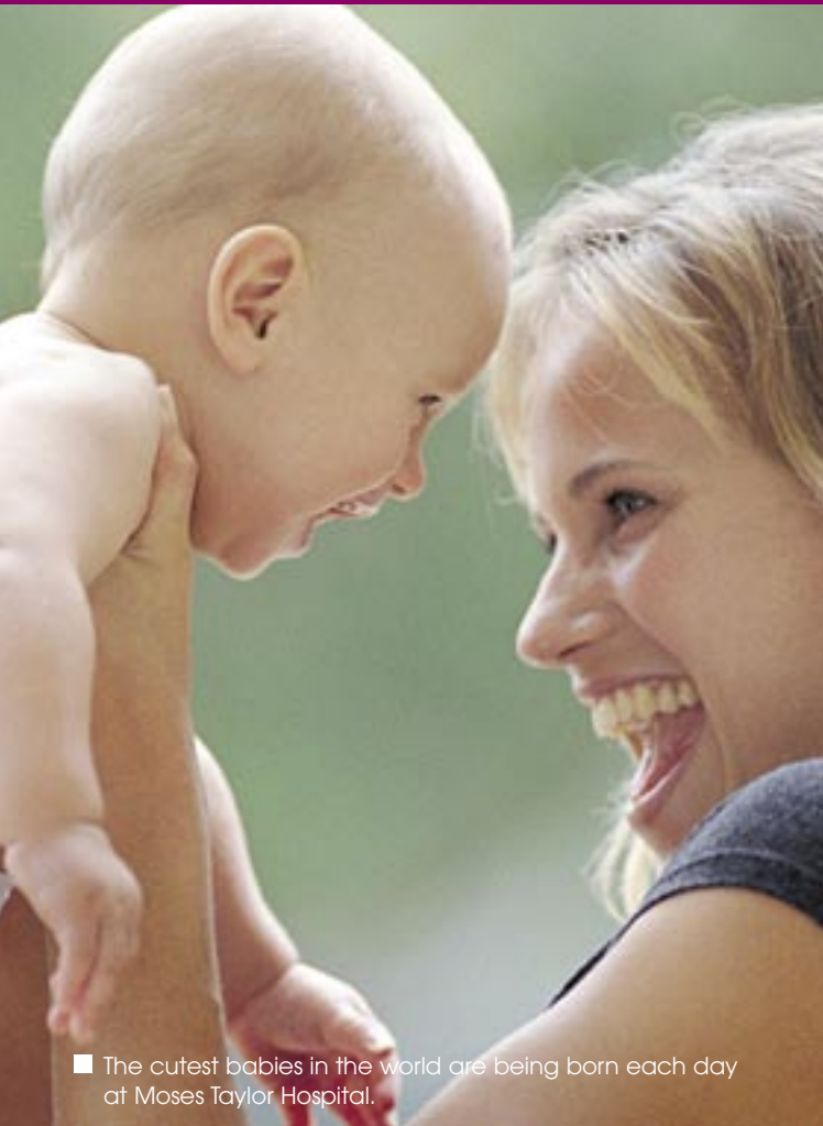
■ The cutest babies in the world are being born each day at Moses Taylor Hospital.